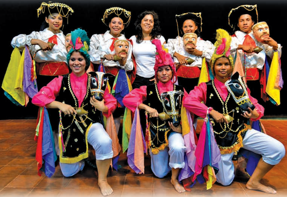
The New Dawn Folkloric Dance Group

Be remembered for the right reasons. Leave a legacy and a smile in your heart beyond life.