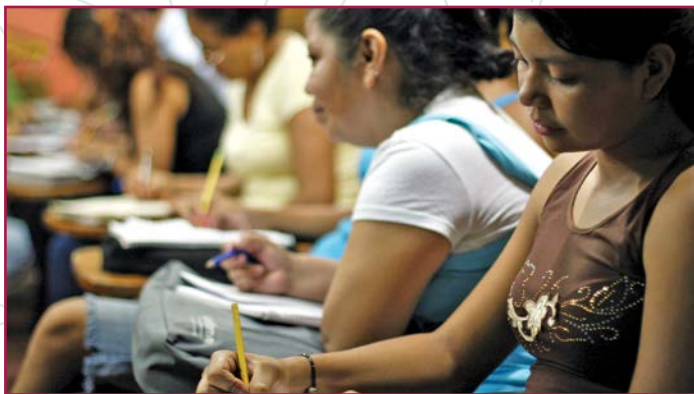
Two hundred women will benefit from the recent Global Giving campaign. The women pictured here are enrolled in the Center's adult basic education literacy classes.