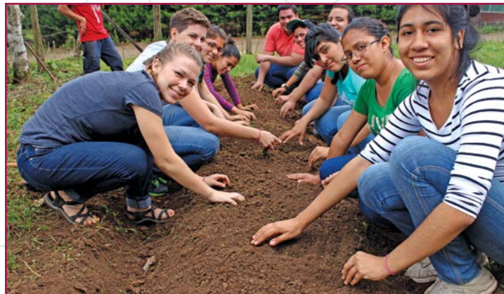
Students work on a raised bed for planting as part of a project funded by Prince of Peace Church in Minneapolis, Minnesota.

Students returned to the Center with a passion to apply what they learned.